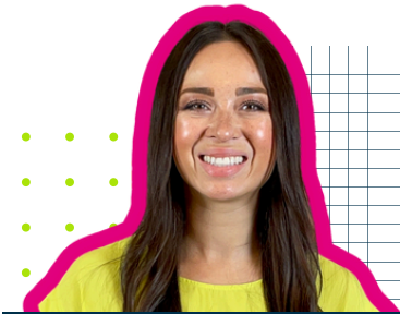
Katya Jones Professional dancer from BBC's Strictly Come Dancing National Numeracy Ambassador