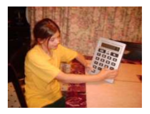
Figure 2. Child using giant calculator

moving up three rows, and across 2 spaces.