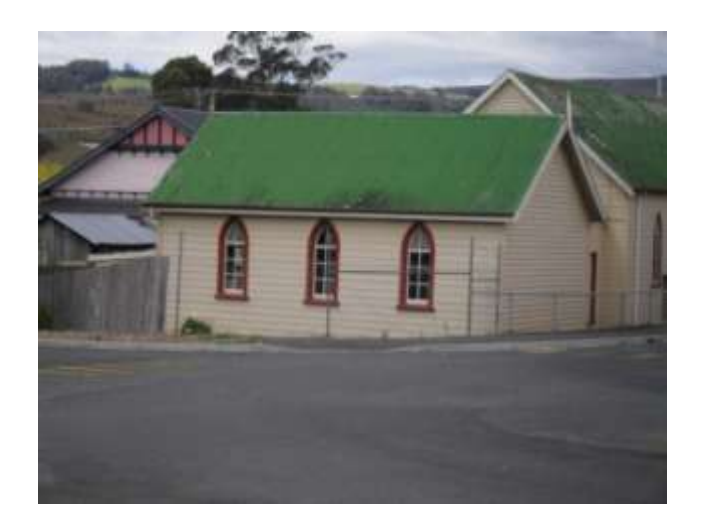
Figure 3. Fraction photo taken by parent